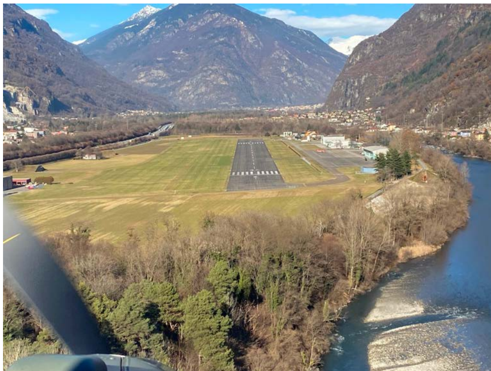
Final Approach Runway 34

Via aeroporto 4 CH-6527 Lodrino info@riviera-airport.swiss +41 91 863 49 40