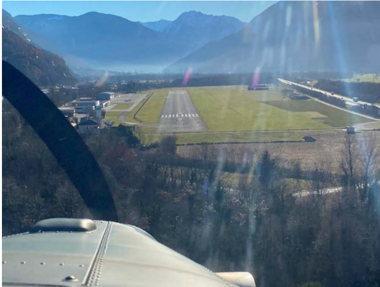
Final Approach Runway 16