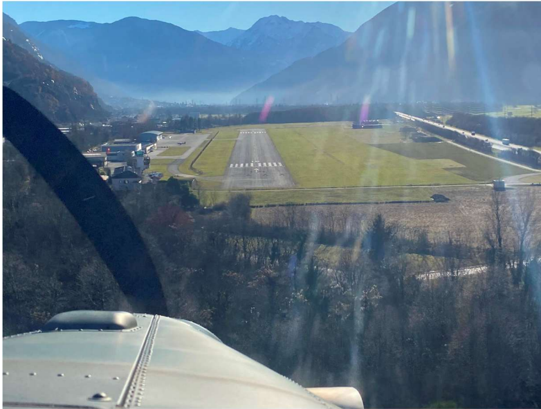
Final Approach Runway 16